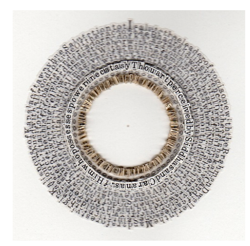
Meg Hitchcock, Hymn to Durga , 2014, Cut paper from the Bible, 14 x 11 inches (35.5 x 28 cm); Framed: 17 x 14 inches (43 x 28 cm)

MH: Very biased and intense, very fundamentalist – which means a lot of things, but to me it's: "I'm right and they're wrong." Like the fundamentalist Muslims, the jihadists – even though I find it reprehensible, I understand how they believe they are right and everybody else is wrong. They believe they are saving people's souls. I know how they feel because I have been there, on the inside of it, and it's very hard to get out of that belief system once you're in it.